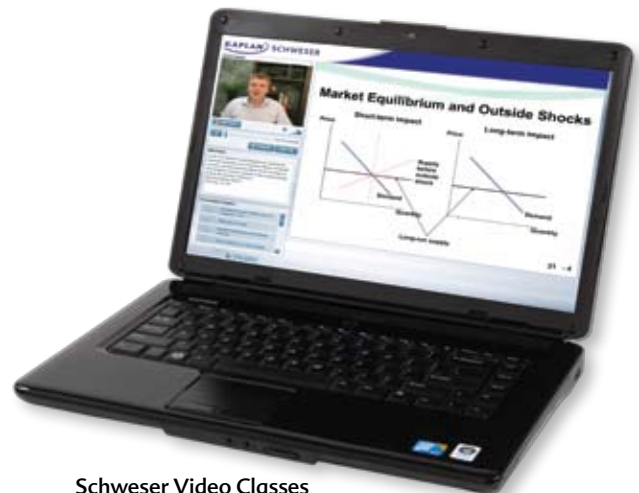
Schweser Video Classes

Also available in the PremiumPlus and Premium Instruction Packages.