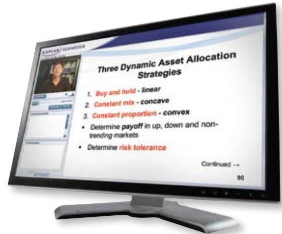
16-Week Online Class

Also available in the PremiumPlus and Premium Instruction Packages.